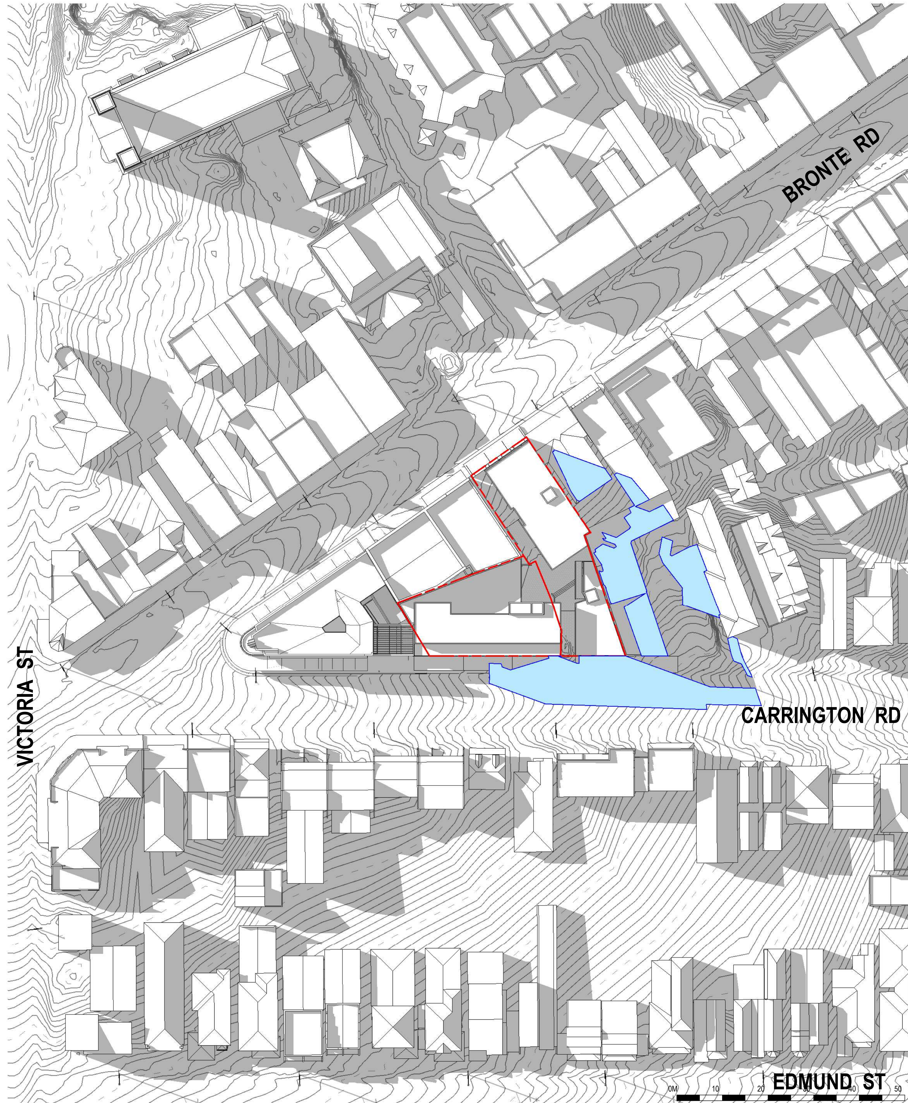
2 Shadow Plan - Proposed - Winter Solstice 10:00AM 1 : 500

Suite 35, Level 2, 94 Oxford Street Darlinghurst NSW 2010 Australia +612 9367 2288 hello@h-e.com.au www.h-e.com.au PO Box 490 Darlinghurst NSW 1300 Humphrey & Edwards Pty Ltd | ABN 88056638227 Nominated Architect: Glenn Cunningham #6415