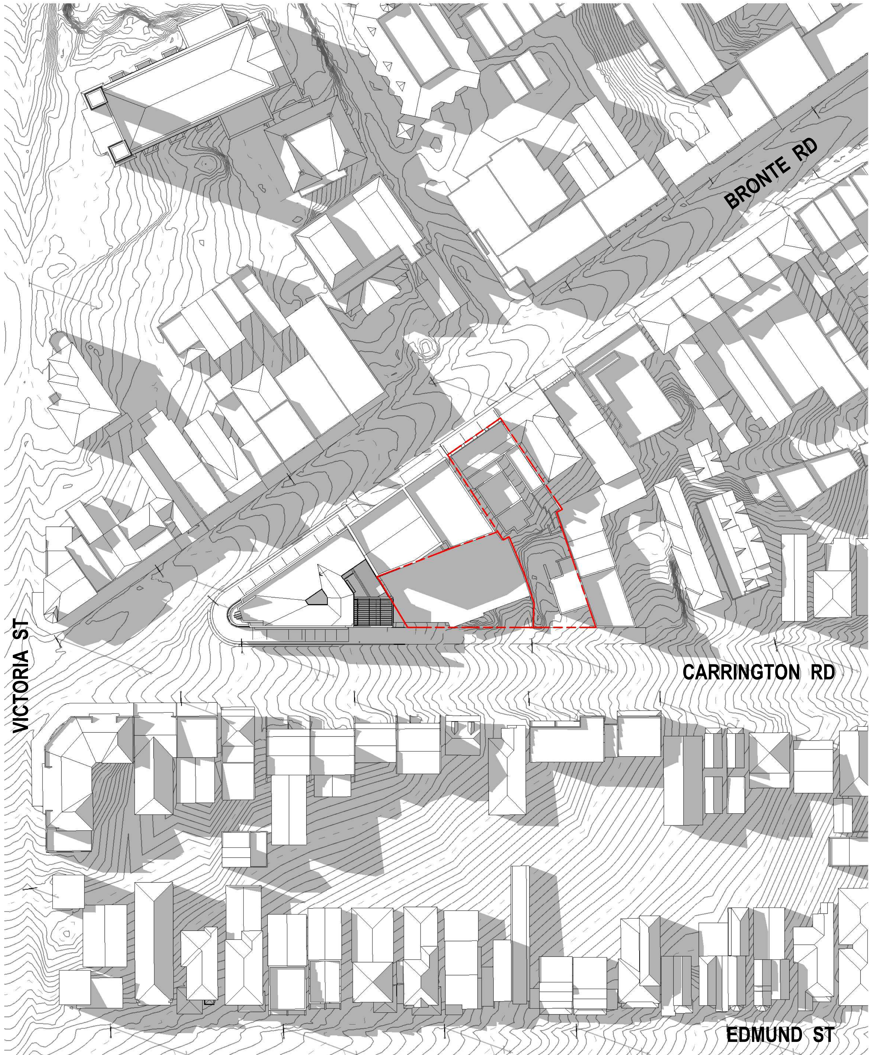
1 Shadow Plan - Existing - Winter Solstice 10:00AM 1 : 500

General Notes The copyright of this design remains the property of H&E Architects. This design is not to be used, copied or reproduced without the authority of H&E Architects. Do not scale from drawings. Confirm dimensions on site prior to the commencement of works. Where a discrepancy arises seek direction prior to proceeding with the works. This drawing is only to be used by the stated Client in the stated location for the purpose it was created. Do not use this drawing for construction unless designated.